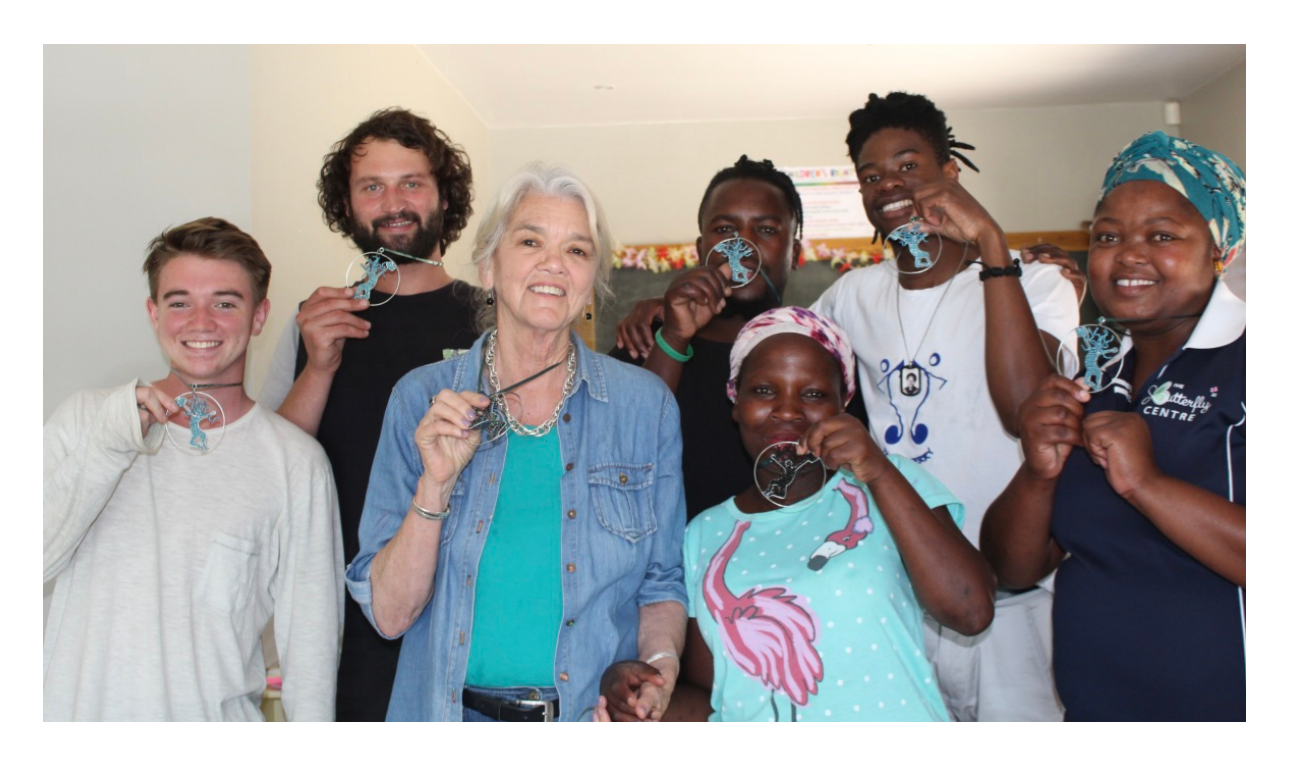
Some volunteers and helpers with their 'medals'