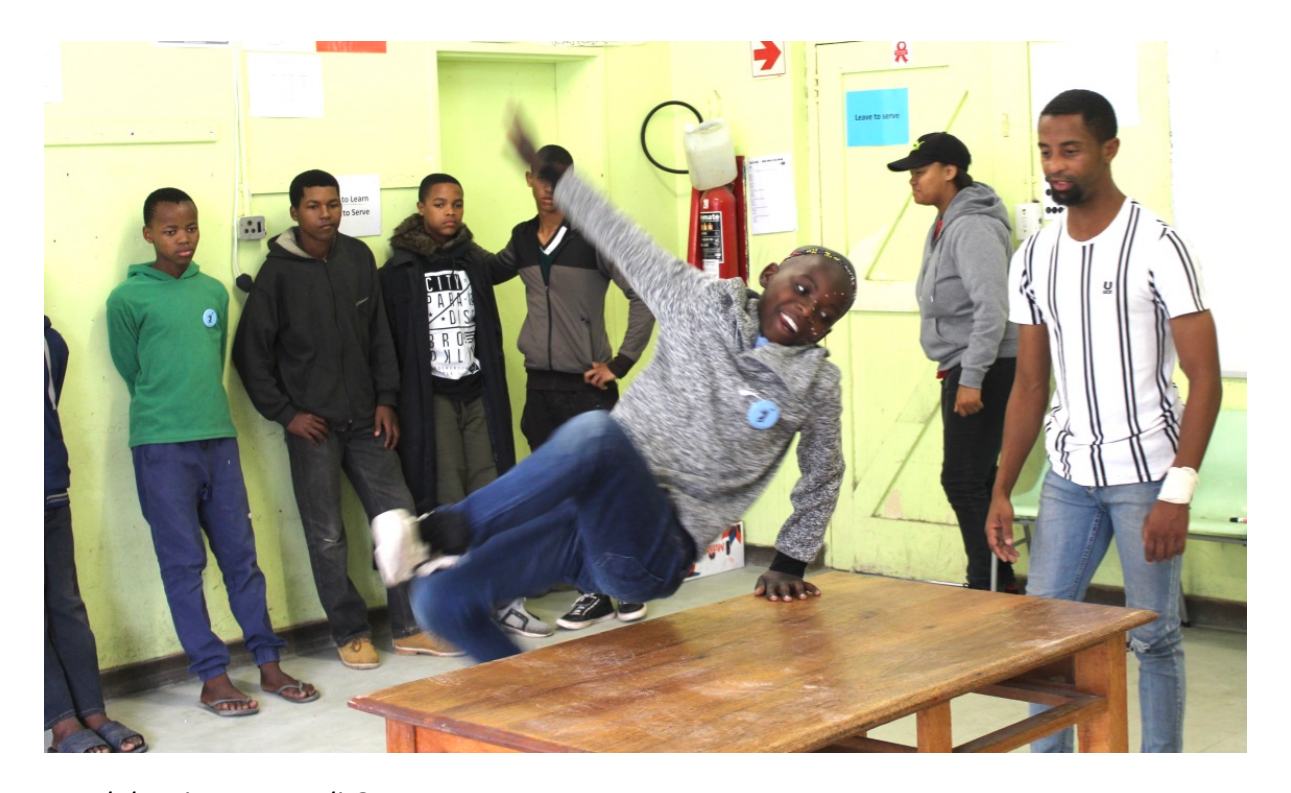
Breakdancing at Mardi Gras