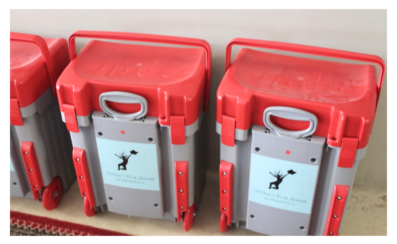
Toolboxes ready to go