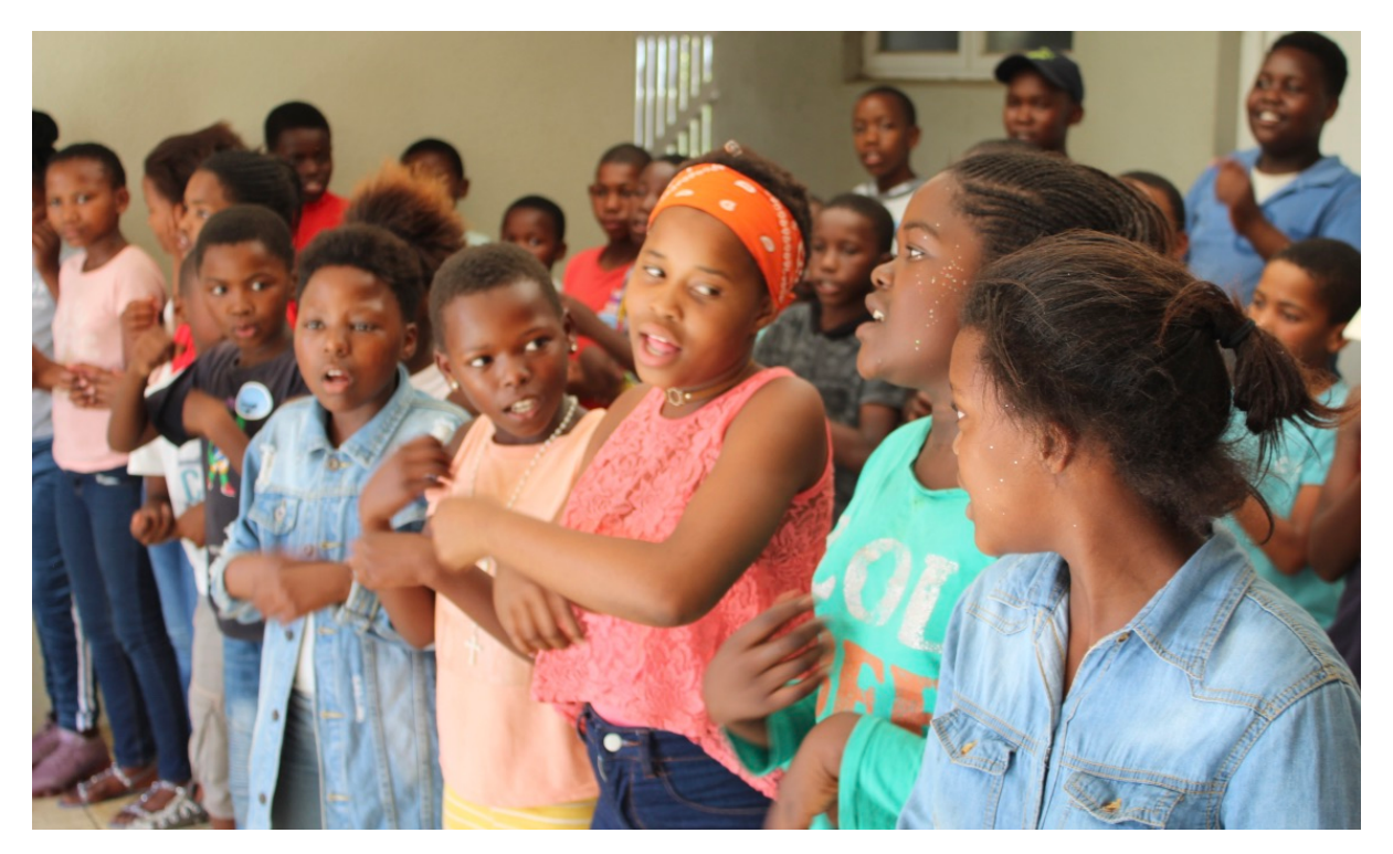
CBN Choir singing together leads to reading together