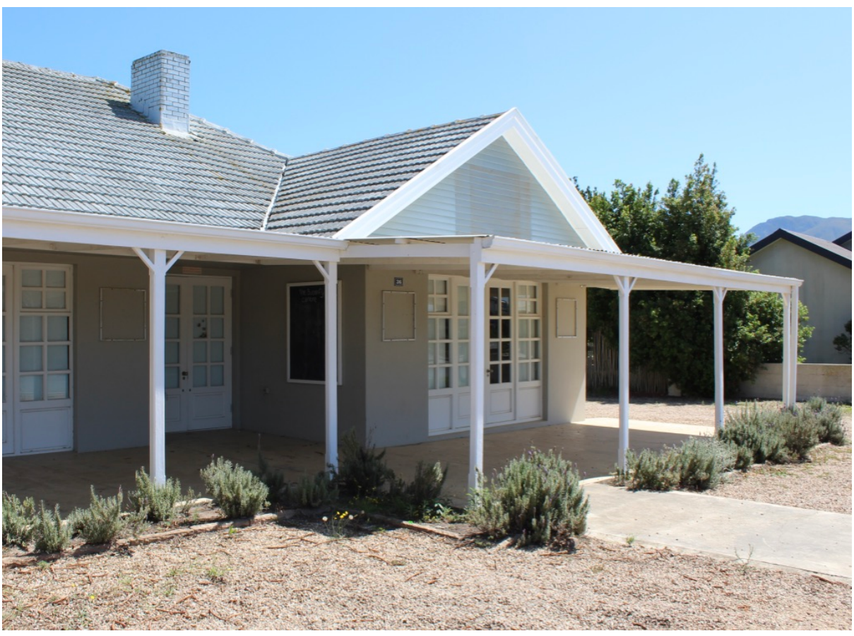
CBN's home at Norfolk Place – soon to be livened up!