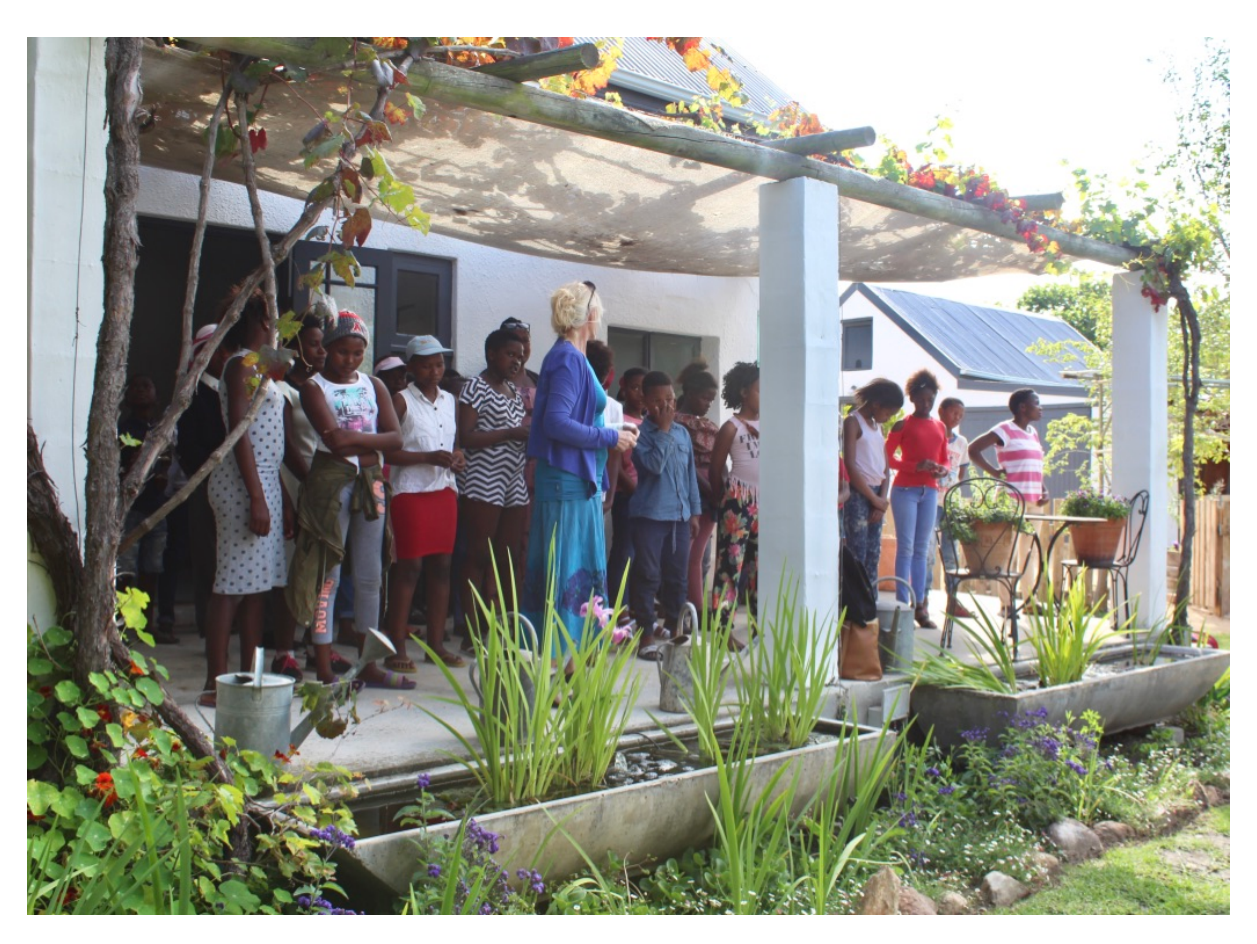
Singing with visiting Dutch choir at Madre's Restaurant in Stanford