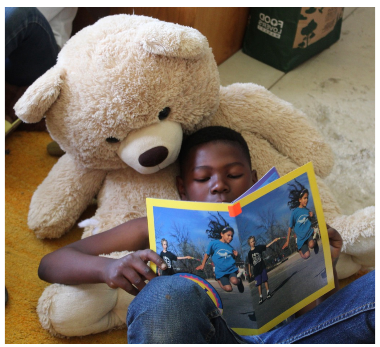
What – in the end – it is all about