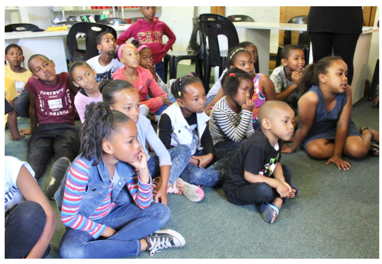
Writing a song in Mitchell's Plain