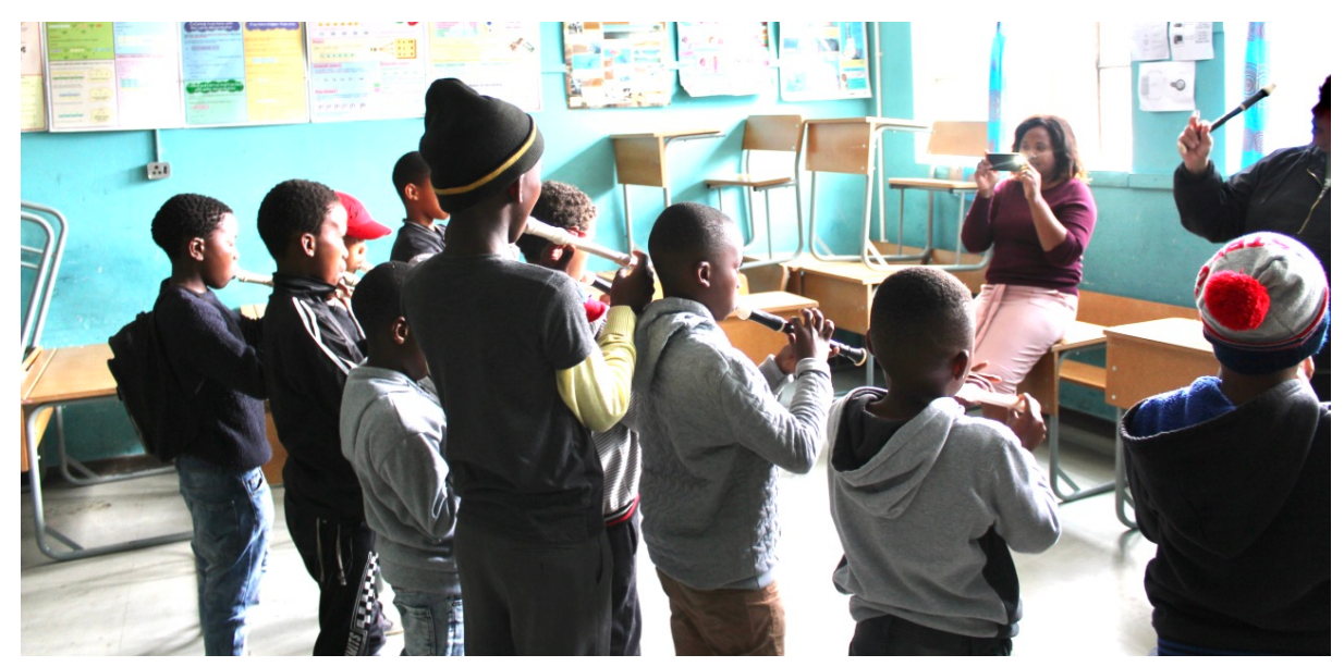
Tootling at Mardi Gras