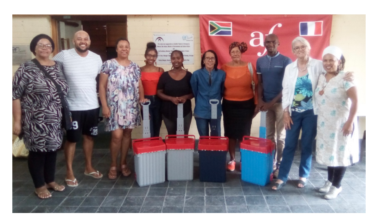
Handing out the last four toolboxes for Mitchell's Plain reading community