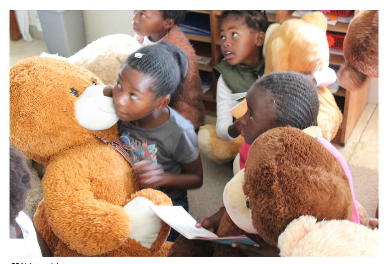
CBN in waiting

Are just as keen! At any workshop, we have a high proportion of younger children (who don't fit into CBN because they basically can't read and don't understand English). We accept them gratefully.