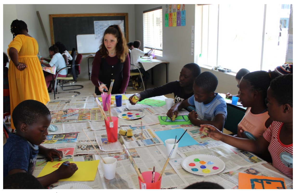
Teen Team Volunteers