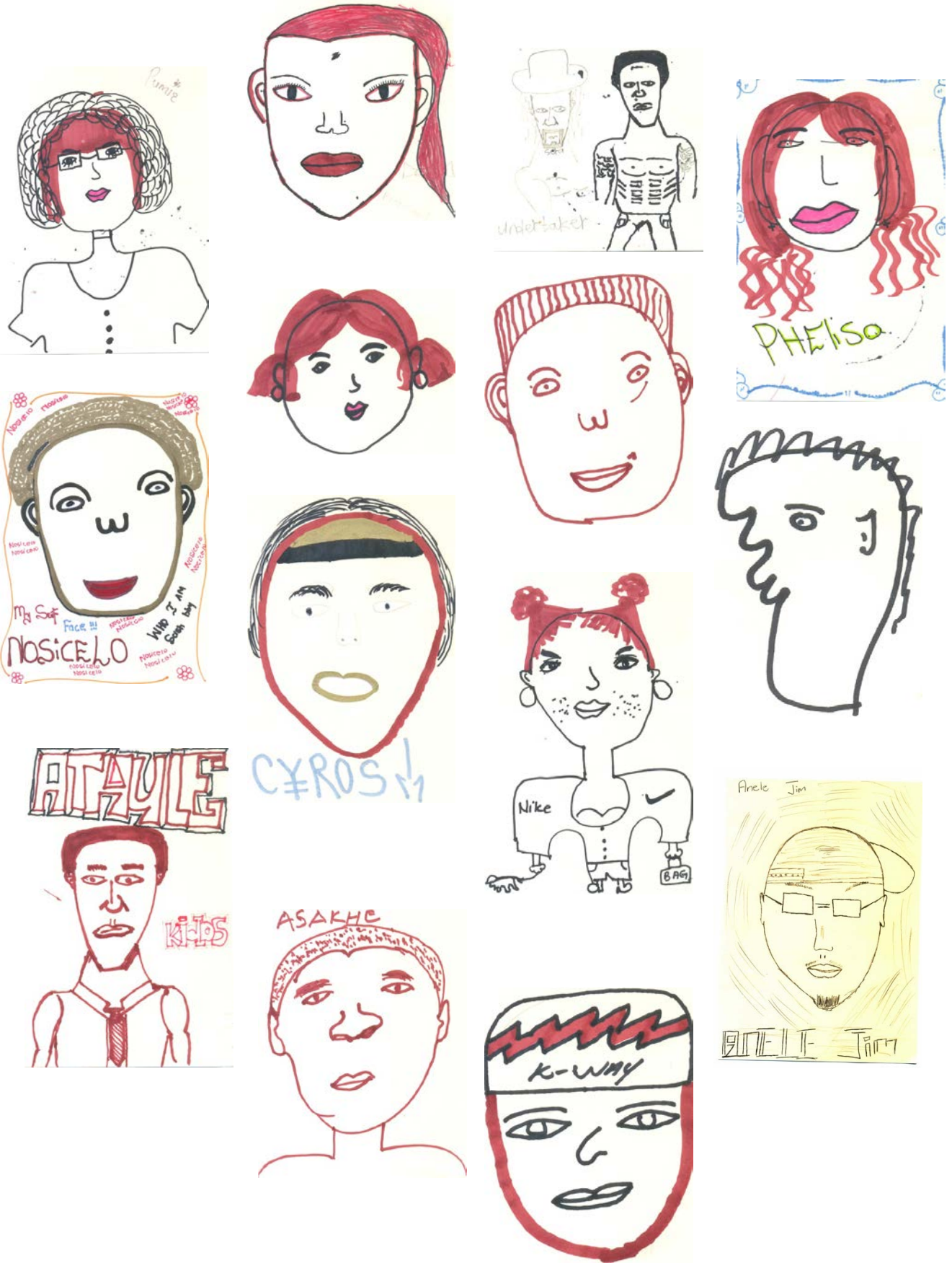
Self portraits by children at Red Hill pilot project