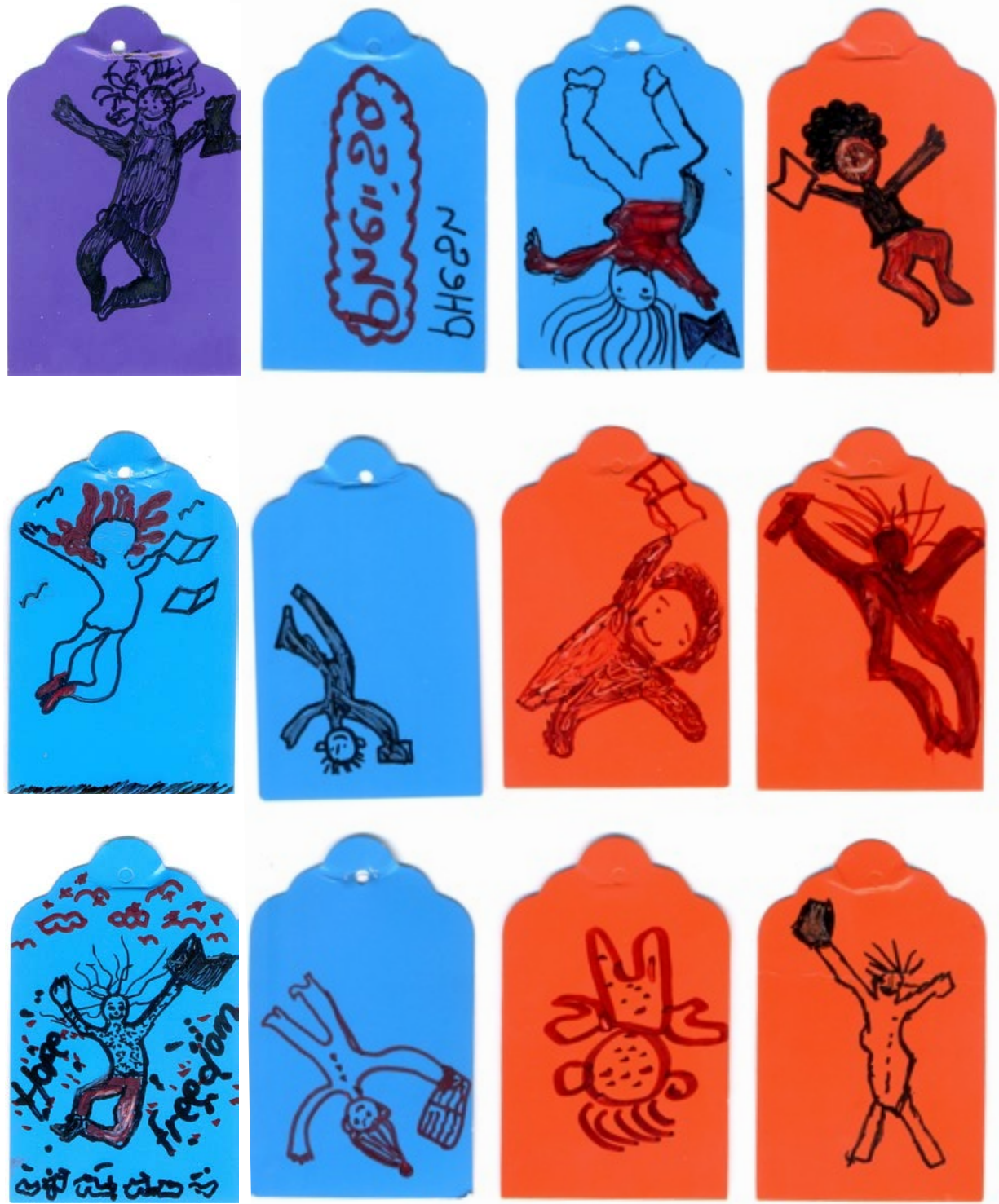
Versions of CBN logo as seen by children